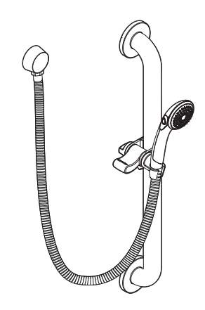
Handheld With Slide Bar/Grab Bar

Model: 52224GBM17 (24" Grab Bar) 52224GBM17CBN (24" Grab Bar) 52236GBM17 (36" Grab Bar) 52236GBM17CBN (36" Grab Bar)