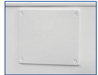
Equipment Access Panel