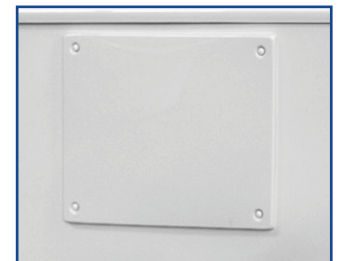
Equipment Access Panel